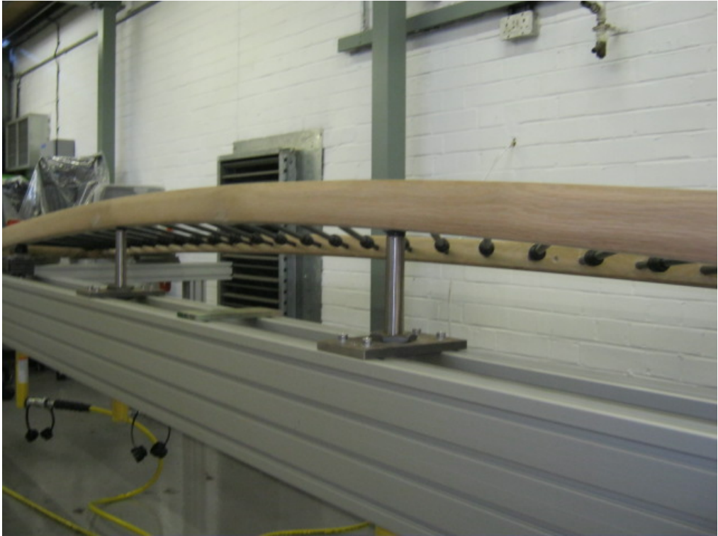
Plate 2: Metal Balusters 3.6m Rake Balustrade, American White Oak on Test