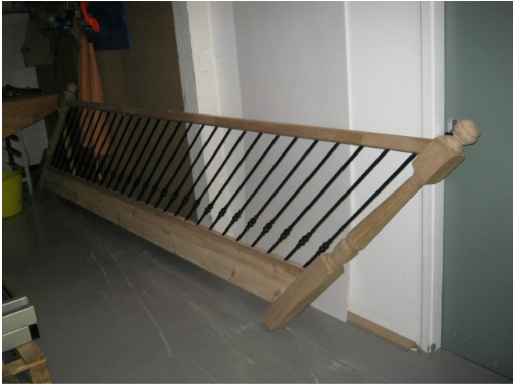
Plate 1: Metal Balusters 3.6m Rake Balustrade, American White Oak before Test