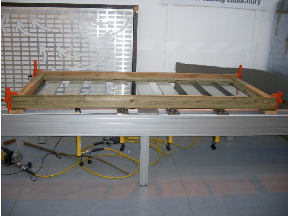
Plate 2: OB11 Glass Panel Carrying Rail System Unit on Test