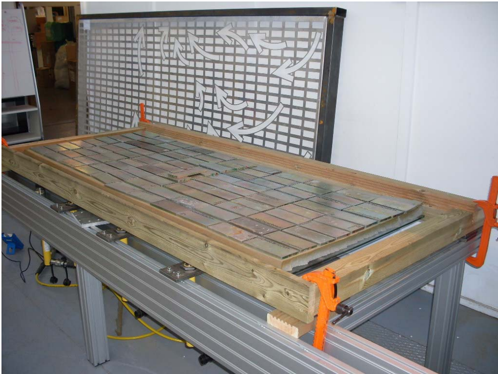
Plate 3: OB11 Glass Panel Carrying Rail System with In-fill load applied