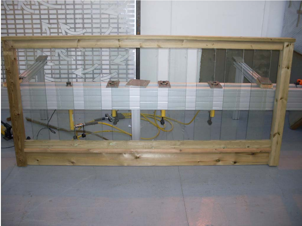
Plate 1: OB11 Glass Panel Carrying Rail System Unit before Test