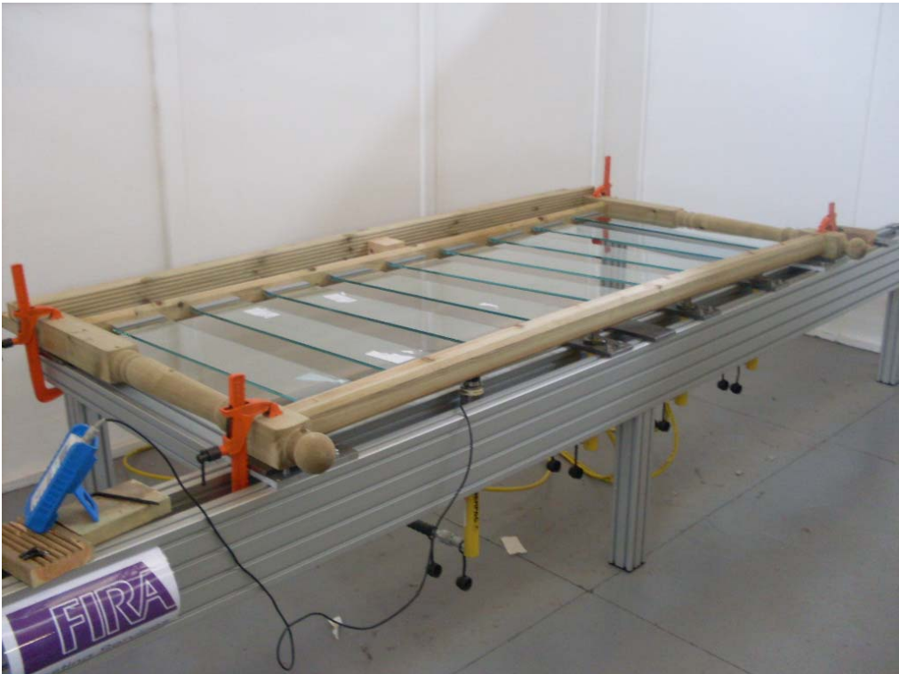
Plate 2: Softwood Decking Glass Panel System Unit on Test