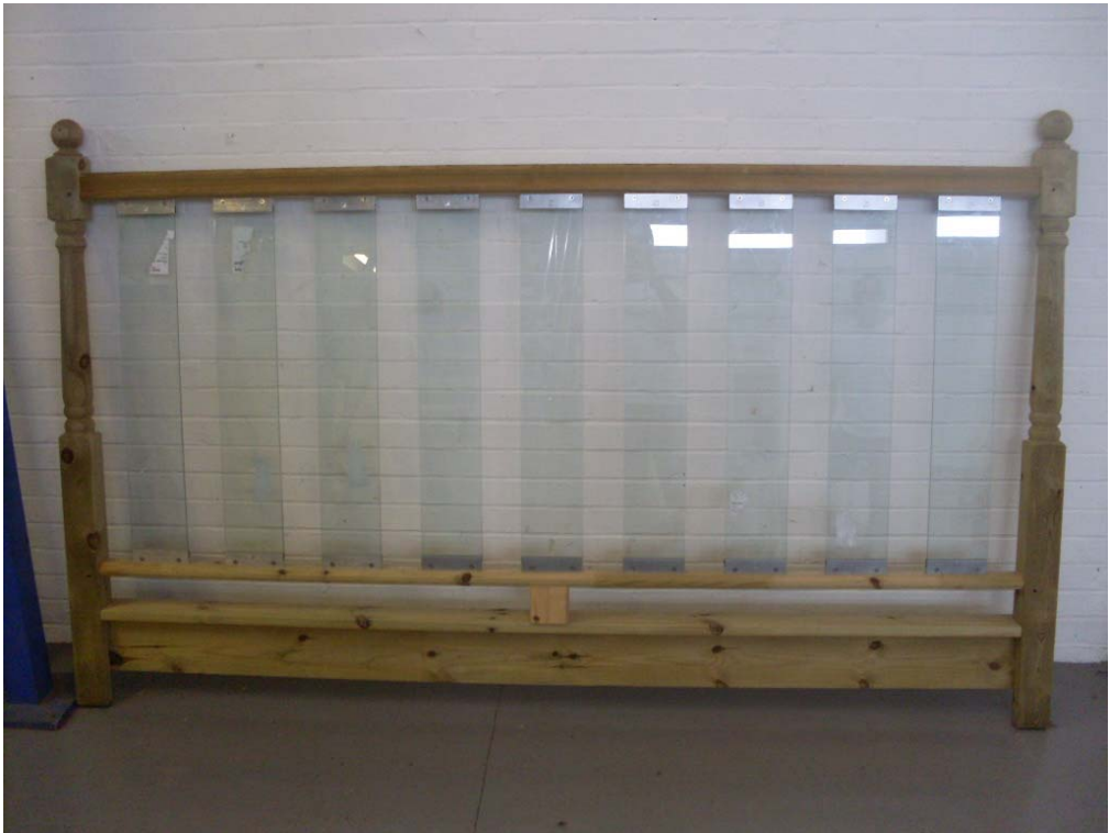
Plate 1: Softwood Decking Glass Panel System Unit Before Test