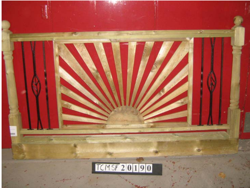
Plate 1: Sunburst Infill Panel